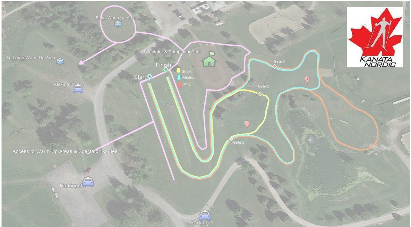
Map-1: Short (Yellow 450m), Medium (Blue 650m) & Long (Red 850m) prologue & sprint courses